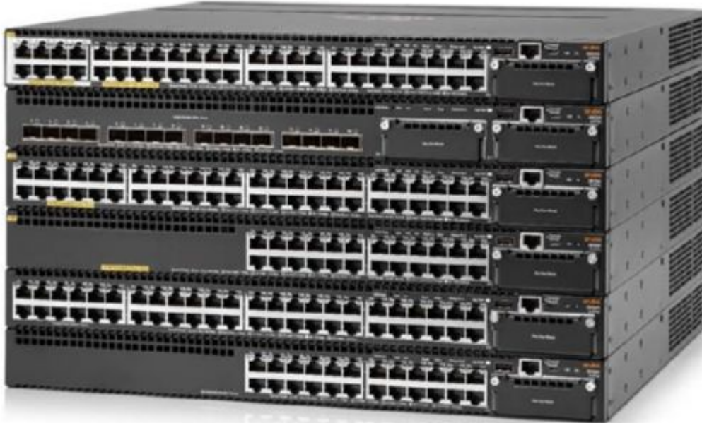
Aruba 3810M Switch Series

The 3810M is easy to deploy, use and manage using Aruba AirWave or Aruba Central. Aruba ClearPass offers centralized security and external captive portal support. The switches offer a limited lifetime warranty.